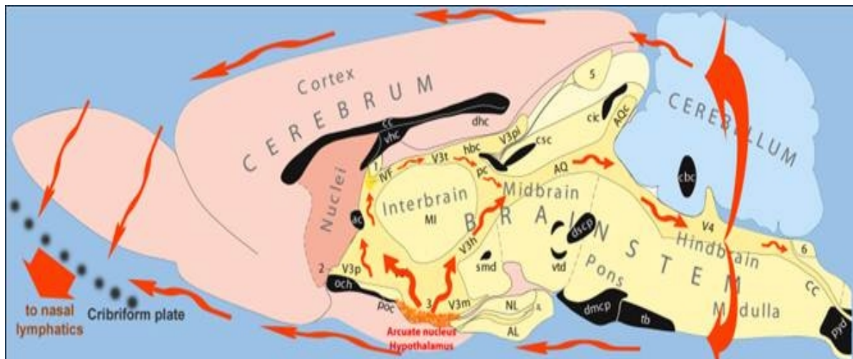
Figure 2 Diagram showing the flow of CSF in the volume transmission of \beta -endorphin. The main release site for \beta -END is the arcuate nucleus of the hypothalamus. The additional hindbrain site is located just ventral to no 6. The flow of the CSF (red arrows) traverses the aqueduct (AQ) to penetrate the mesencephalic periaqueductal gray before reaching the 4 th ventricle (V4), and along the 'vagal-complex' region. Both regions are important target areas