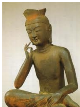
The middle way