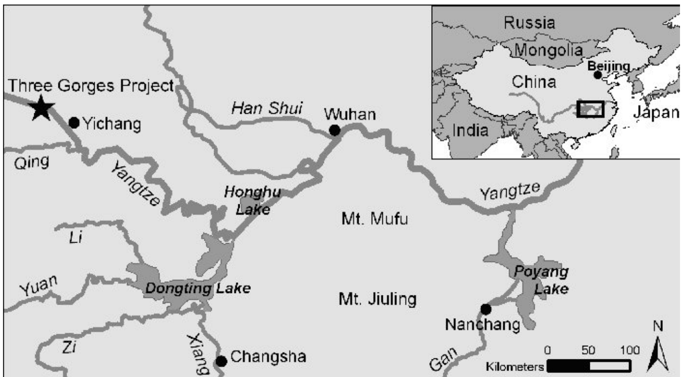
Fig. 1. China and the Yangtze River basin, including Poyang Lake and Dongting Lake.

areas in China, known as the Yangtze River Economic Belt. The Yangtze is also the major inland navigation waterway with a navigation channel totaling 57,000 km (of which 2837 km is mainstream), 52.5% of the nation's total. The shipping capacity is equivalent to four to six railways, each of this same length (Changjiang Water Resources Commission (CWRC) 2009). The Yangtze is a major resource for irrigation, agriculture, and hydroelectric power (with a technically exploitable potential of 25,6270 MW and an estimated annual power output of more than 100 TWh, equivalent to 48% and 49%, respectively, of the nation's totals). It currently holds 17 hydroelectric dams, including the well-known Three Gorges Dam. The Yangtze agricultural area delivers close to half the country's total crop harvest and contributes about a third of the national grain and GDP total. The river basin is recognized internationally as an important ecosystem that is rich in biodiversity (Yin et al. 2006), and currently, six wetlands are listed as sites under the Ramsar Convention on Wetlands of International